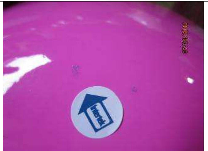
Poor painting at bottom - Major