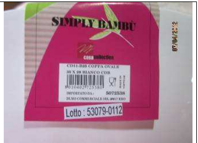
Barcode sticker at rim