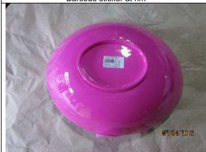
Product - Bottom view