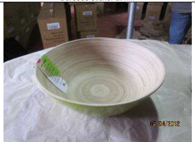
Product – Top view