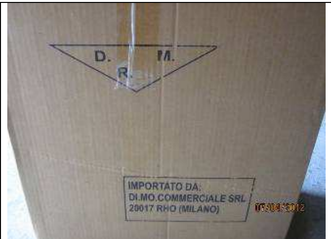
Shipping mark – Long side