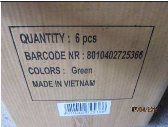
Shipping mark – Short side