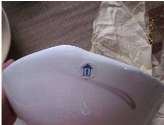
Deformed at rim - Major