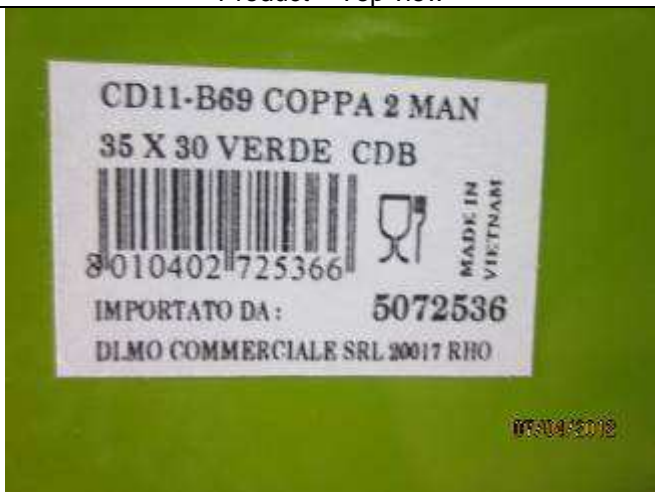
Barcode sticker at bottom