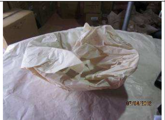
Form of packing