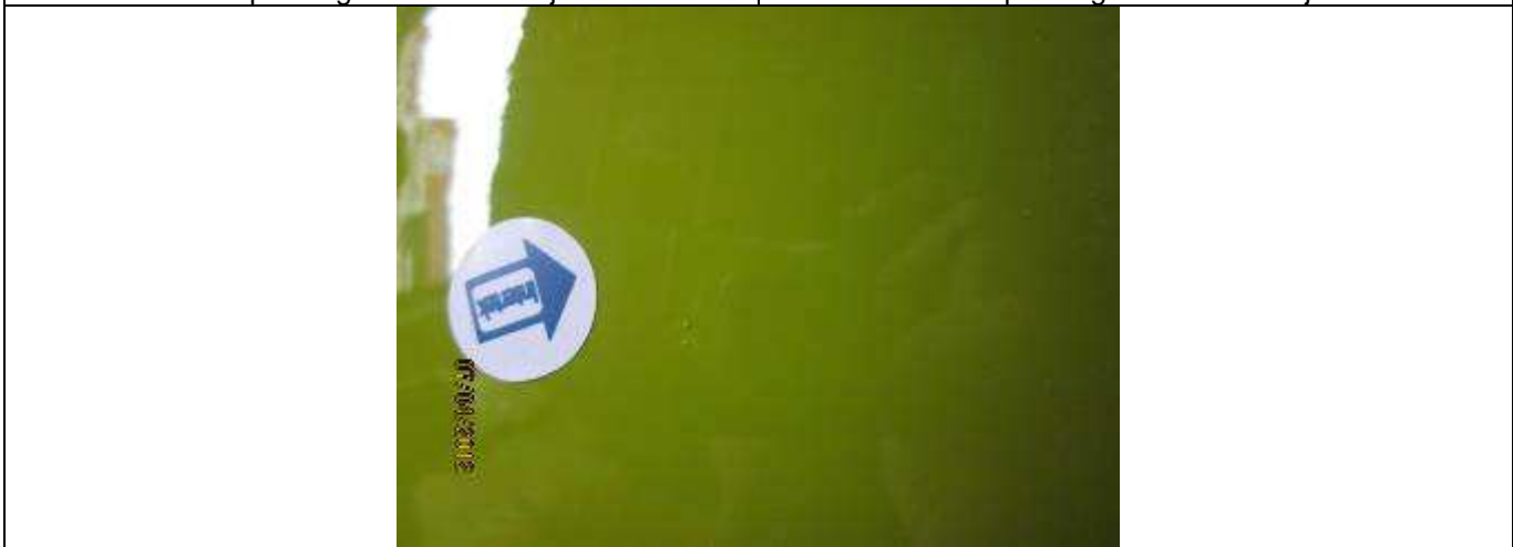
Poor painting at bottom - Minor