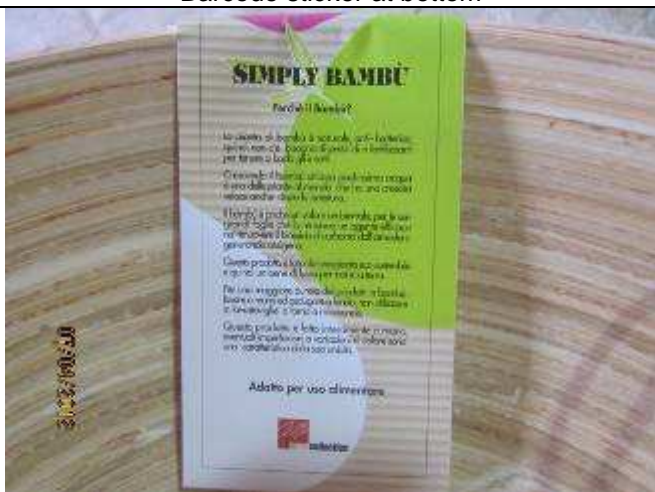
Barcode sticker at rim