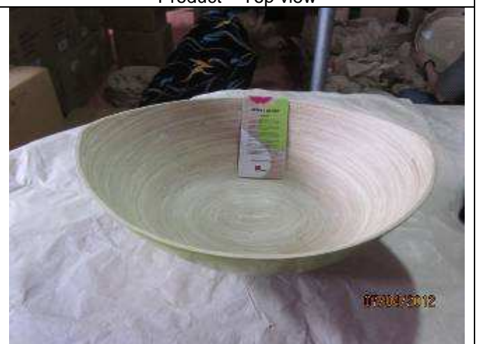
Product - Top view