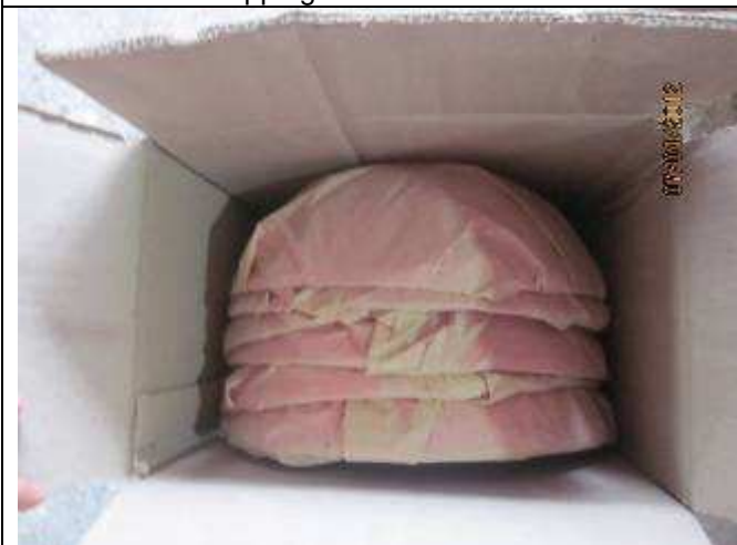
Form of packing