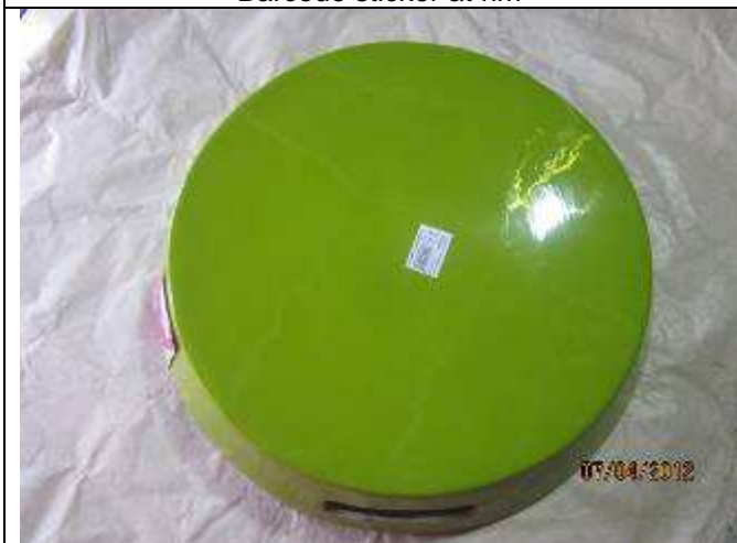
Product - Bottom view