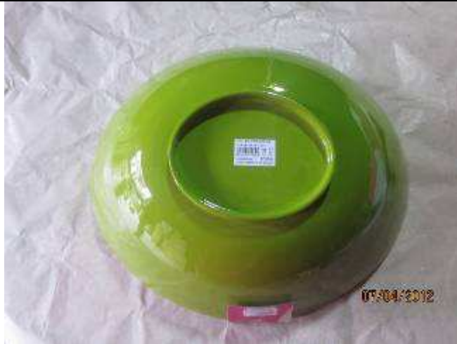
Product – Bottom view Item CD11- B69