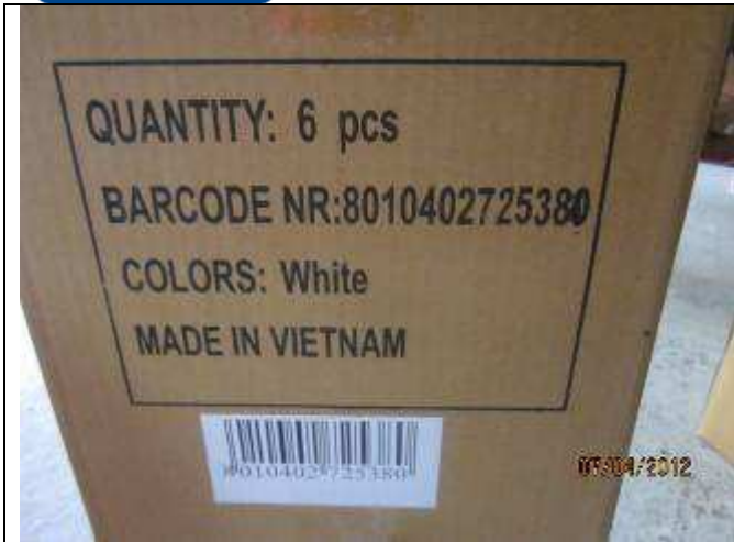
Shipping mark – Short side