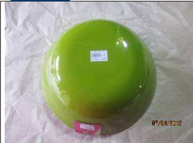
Product – Bottom view