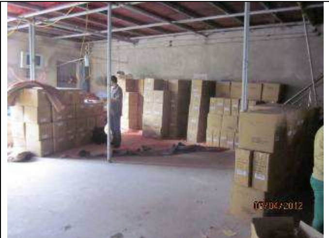
Carton in warehouse Item CD11- B66