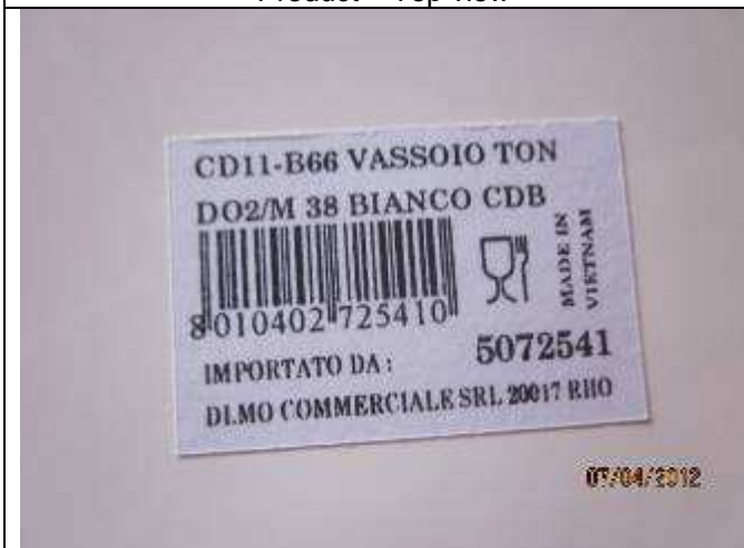
Barcode sticker at bottom