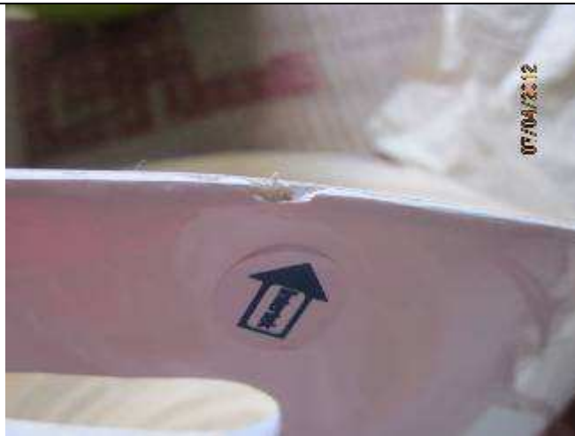
Chipped at rim - Major Item CD11- B25