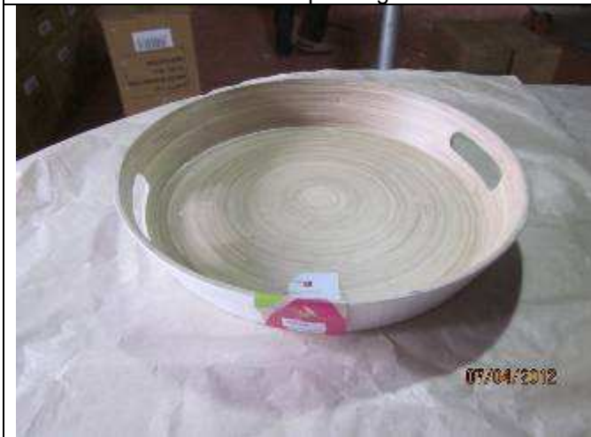
Product – Top view