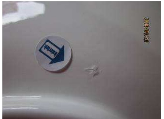
Poor painting at bottom - Minor