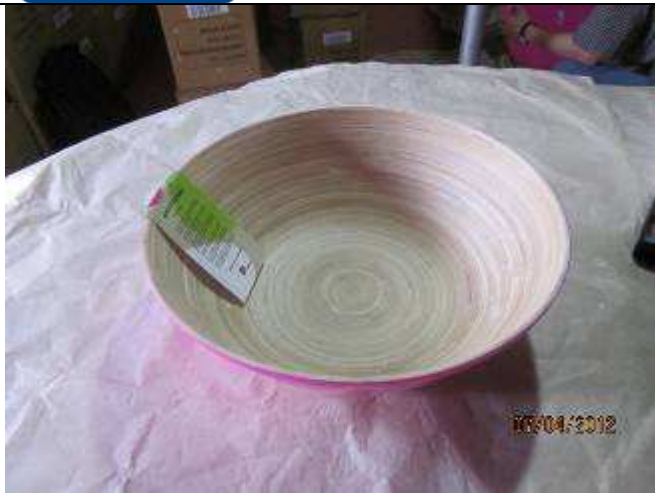
Product – Top view