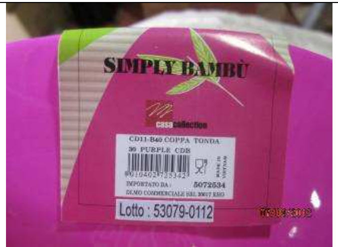
Barcode sticker at rim