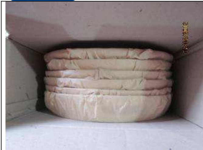
Form of packing