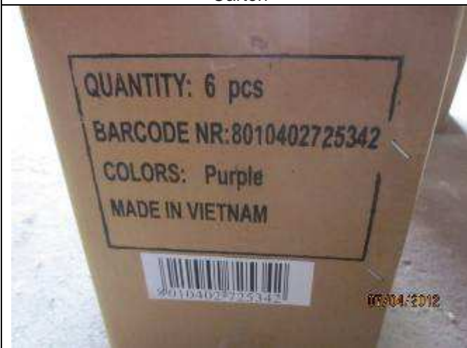
Shipping mark – Short side