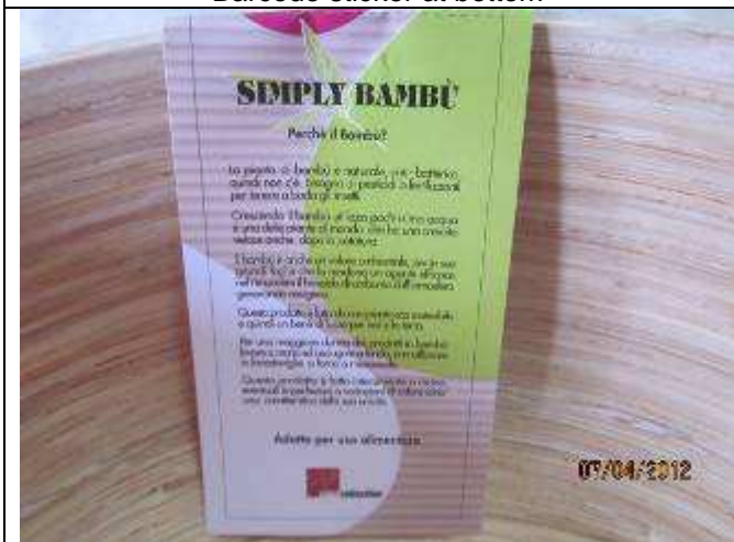
Barcode sticker at rim