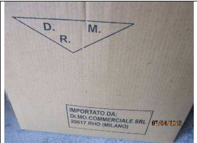
Shipping mark – Long side