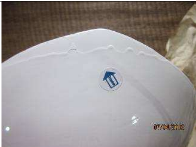
Poor painting at bottom - Major