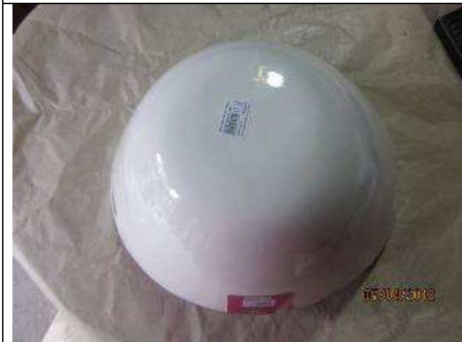
Product - Bottom view