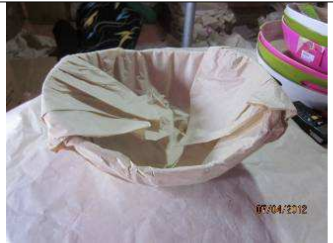
Form of packing