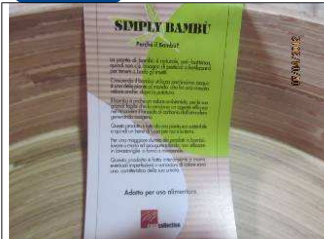
Barcode sticker at rim