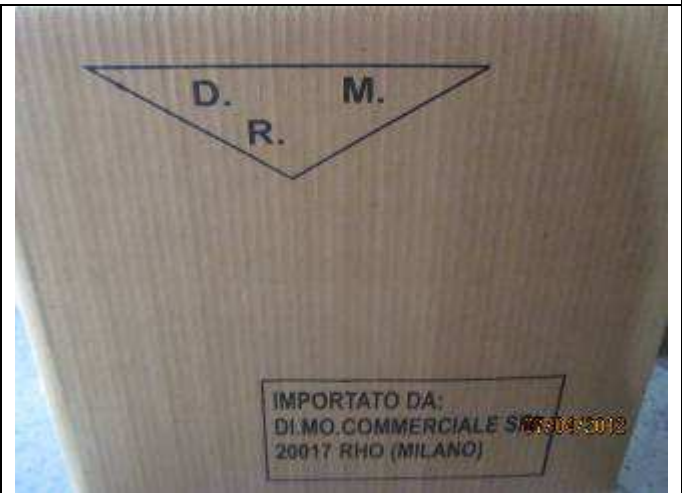
Shipping mark – Long side