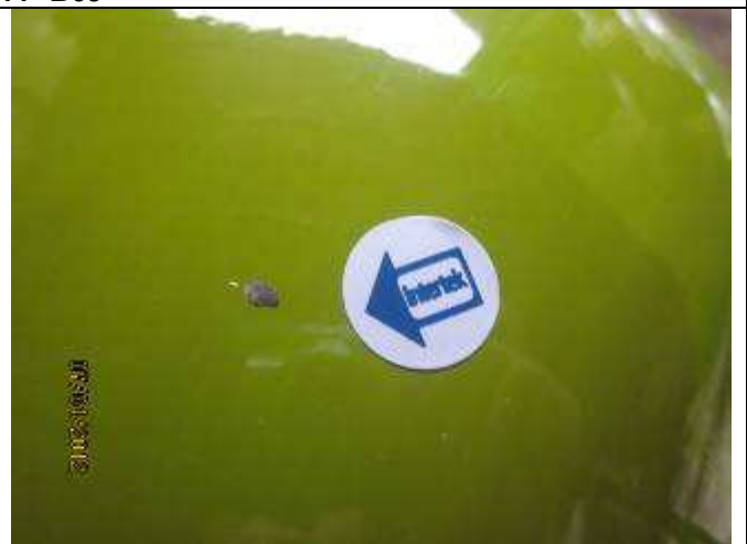
Stain at side - Minor