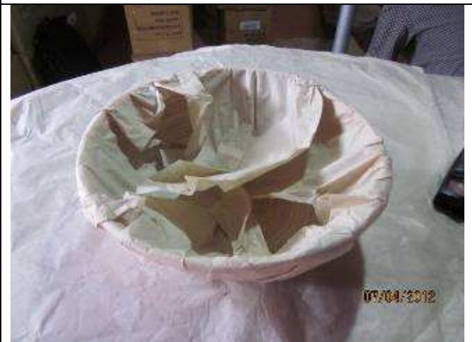
Form of packing