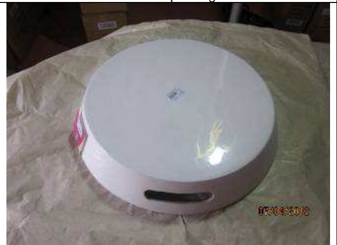
Product – Bottom view