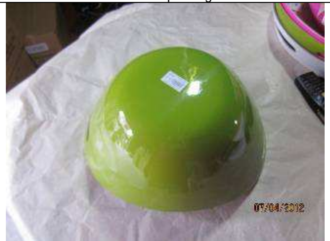
Product – Bottom view