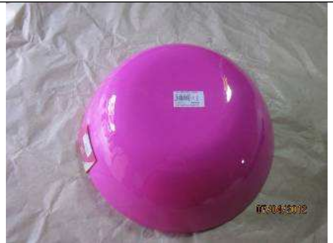
Product – Bottom view