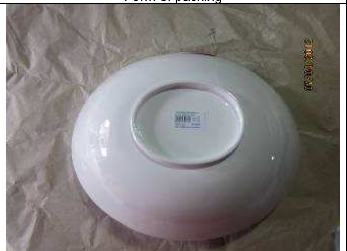
Product – Bottom view