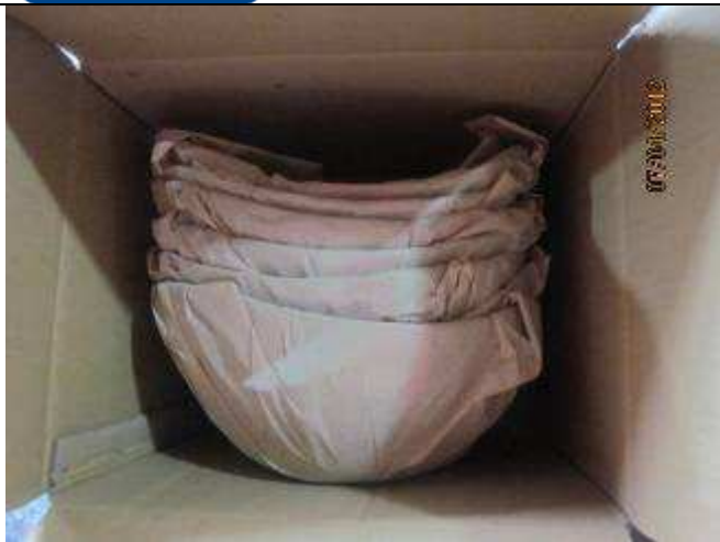
Form of packing