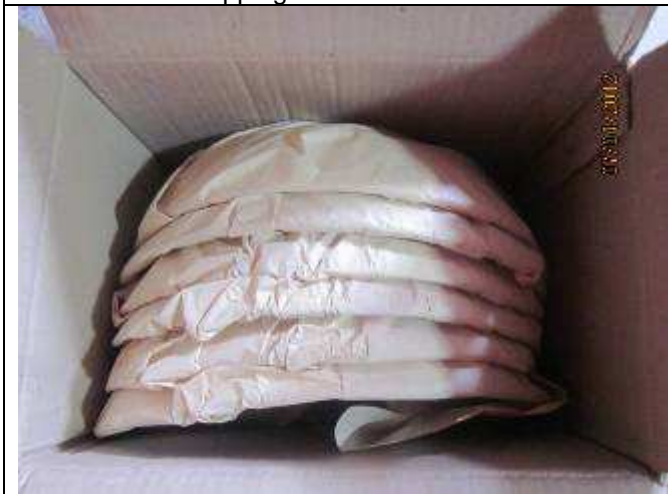
Form of packing