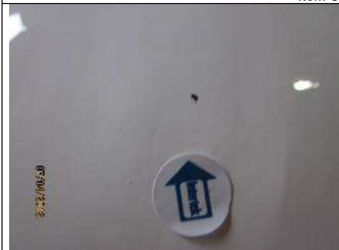
Stain at side - Minor