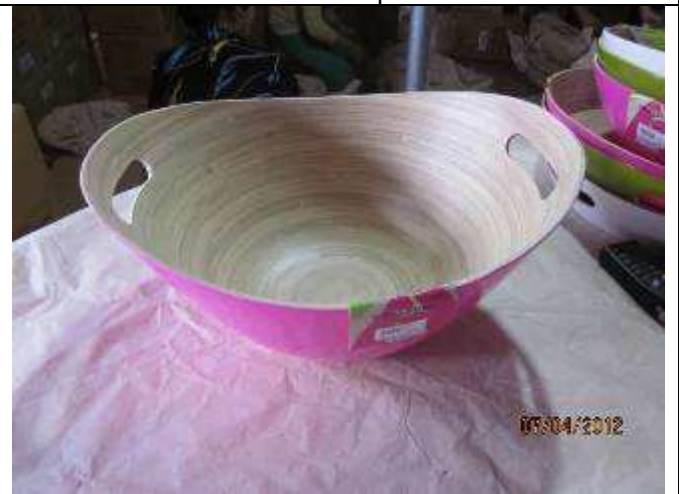
Product - Top view