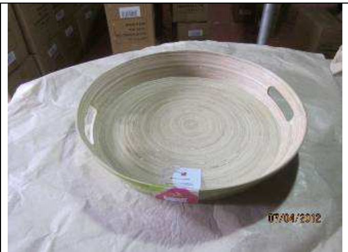
Product - Top view