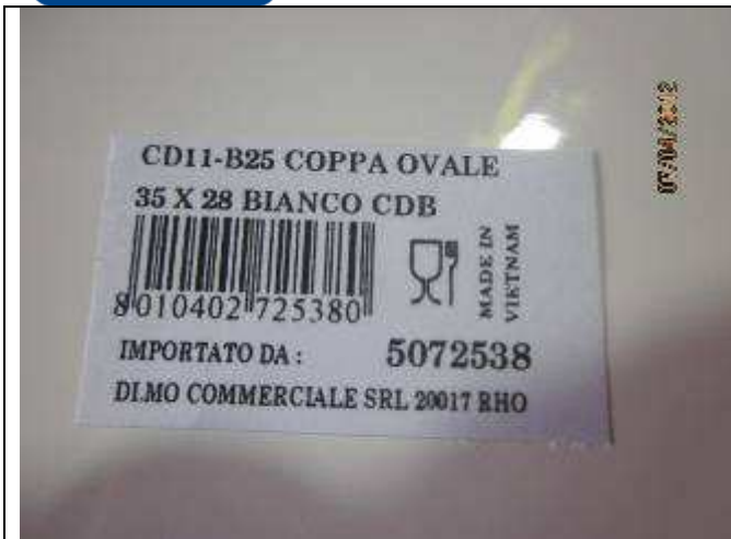
Barcode sticker at bottom