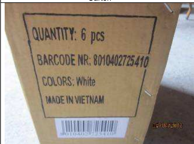
Shipping mark – Short side