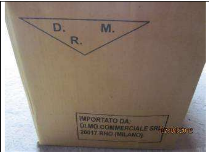
Shipping mark – Long side