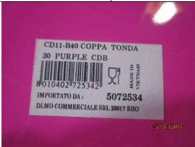
Barcode sticker at bottom