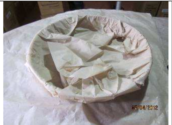
Form of packing