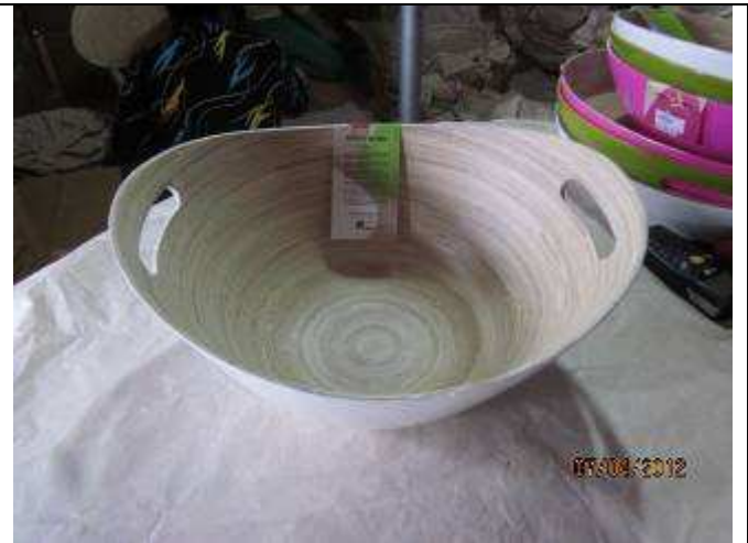
Product - Top view