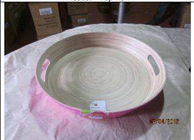
Product - Top view