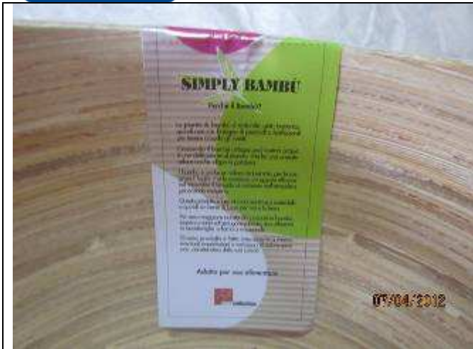
Barcode sticker at rim