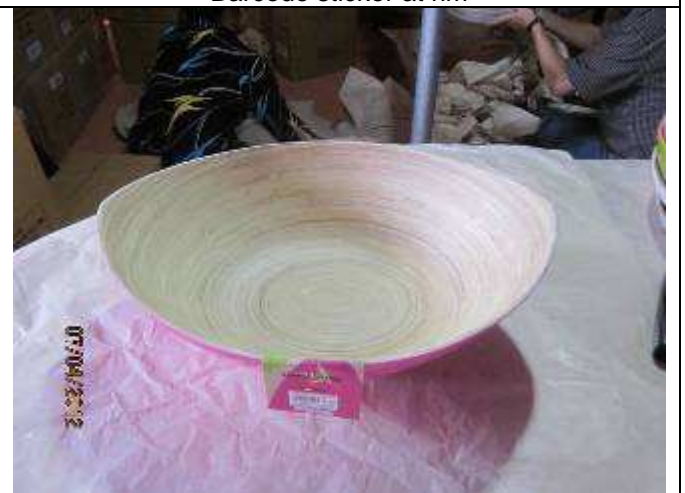
Product - Top view