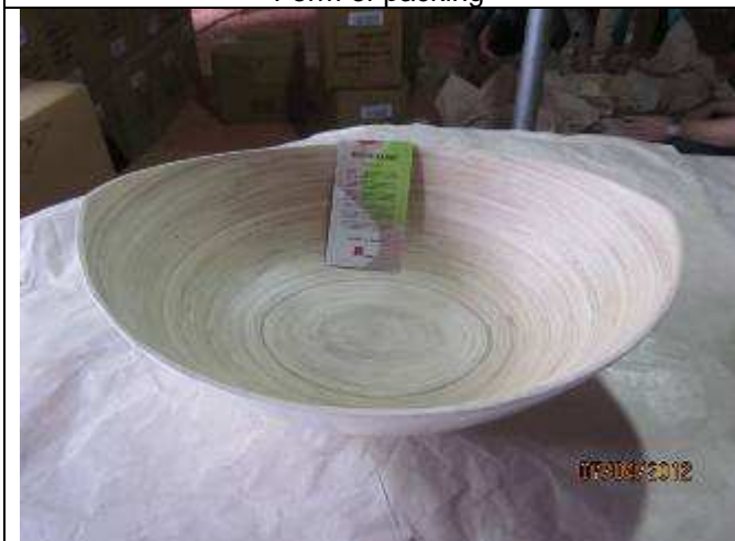
Product – Top view