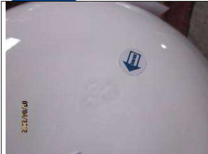
Poor painting at bottom - Major