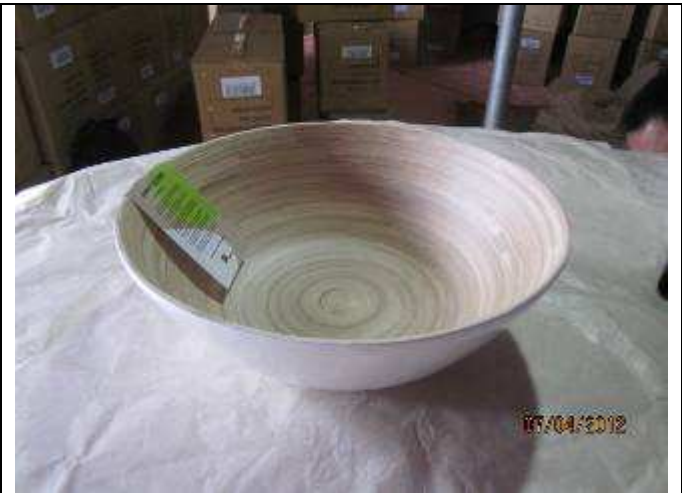
Product – Top view