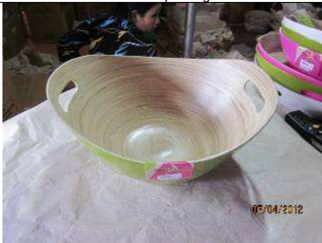
Product – Top view