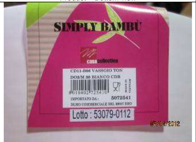
Barcode sticker at rim