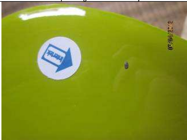
Stain at side - Minor