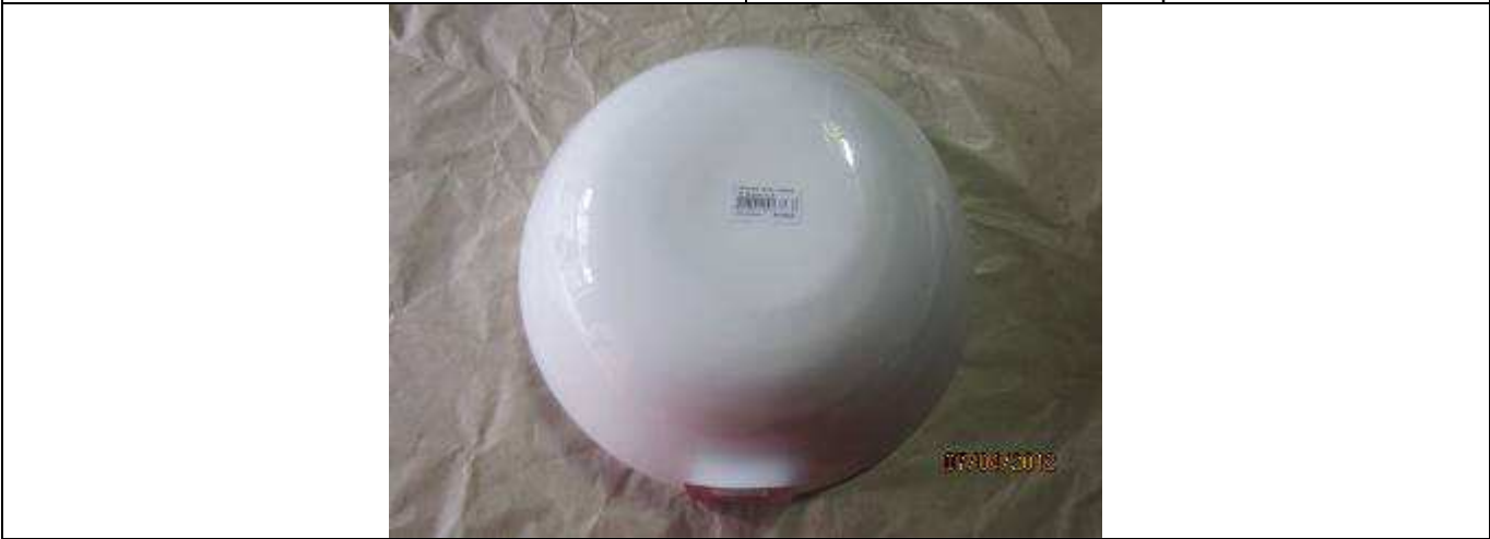
Product – Bottom view