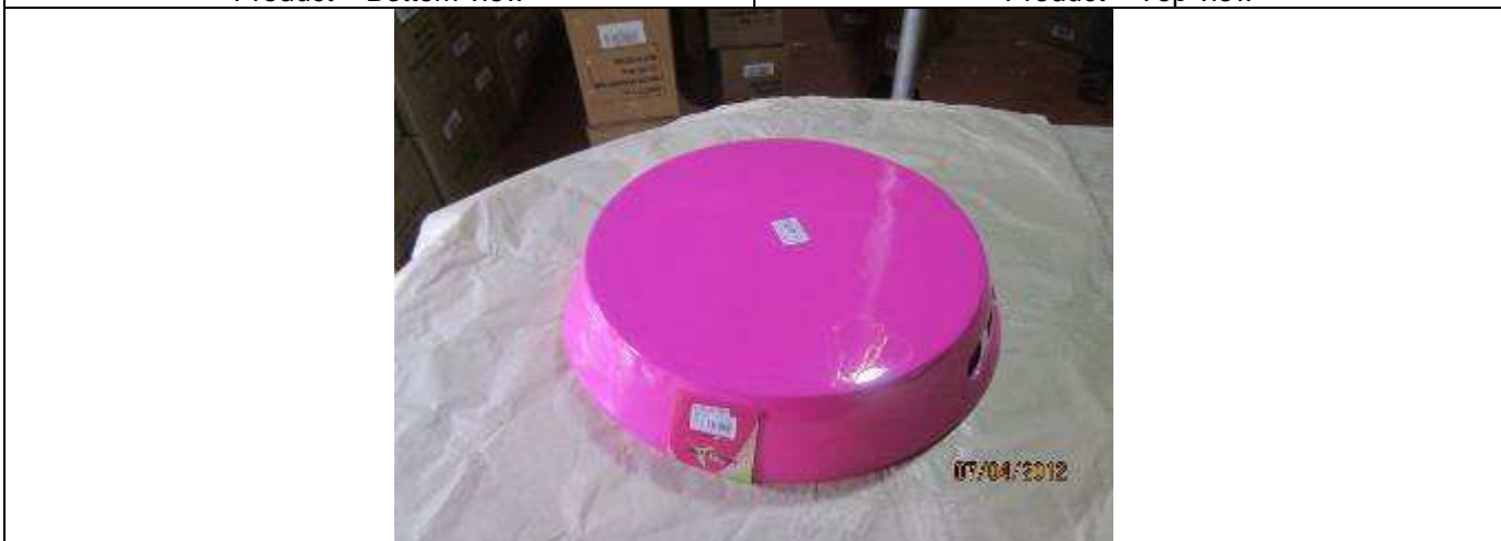
Product - Bottom view