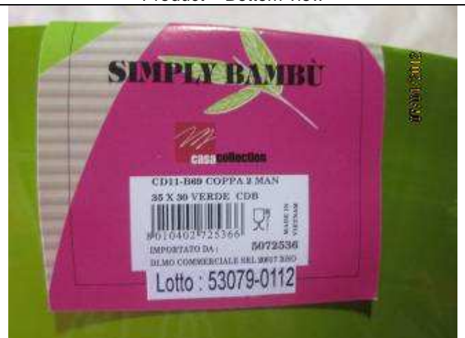
Barcode sticker at rim