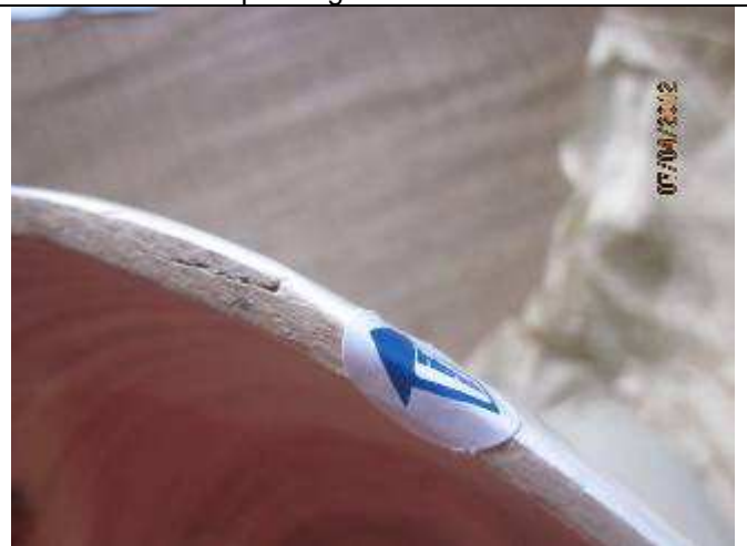
Cracked at rim - Major